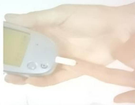
Diabetes mellitus (DM) patients (n=164)