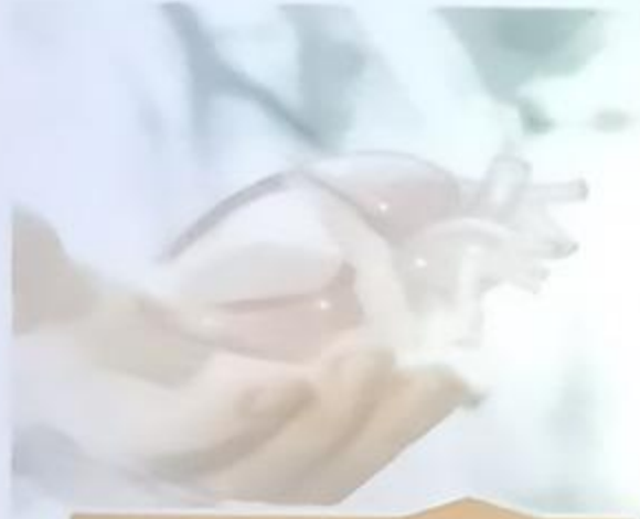
Heart failure (HF) patients (N=156)